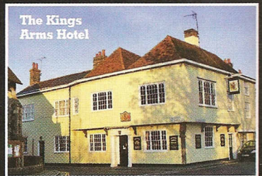
The Kings Arms Hotel